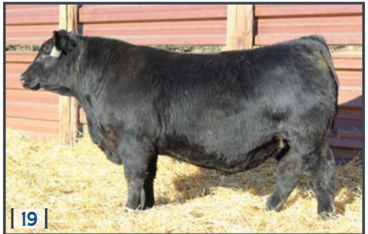
[ 19 ]

Lot 19 is moderate in his frame, but carries extreme thickness and capacity.