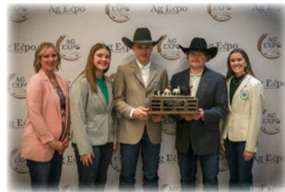
ND State Champion Sr. 4-H Livestock Judging Team