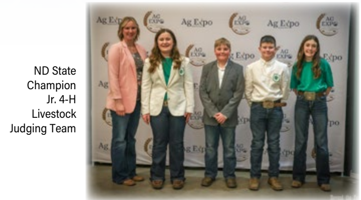
ND State Champion Jr. 4-H Livestock Judging Team