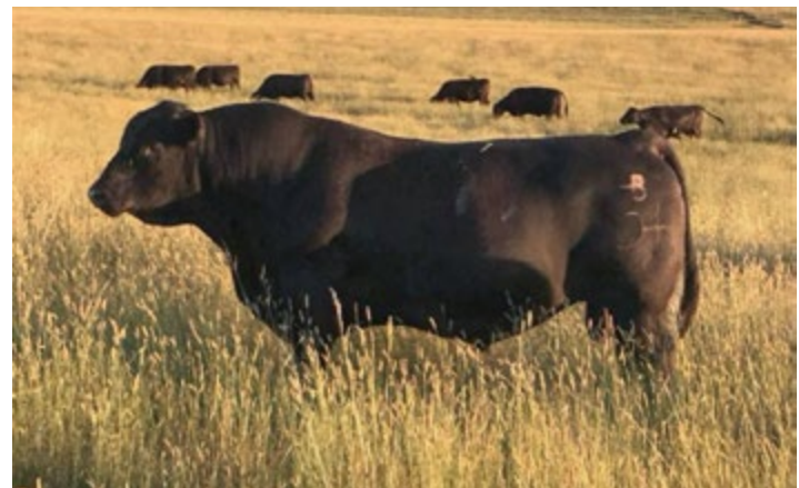
Brooks Playbook 8350 • Sire of lot 47

Lot 47 is another good calf out of a pathfinder dam who raises a good one every year.