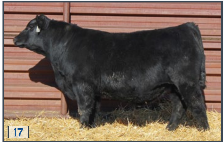
[ 17 ]

Lot 16 does many of the things we like from Coalition. He is moderate framed, with good disposition and feet. His cow family goes back to some really productive long lasting females.