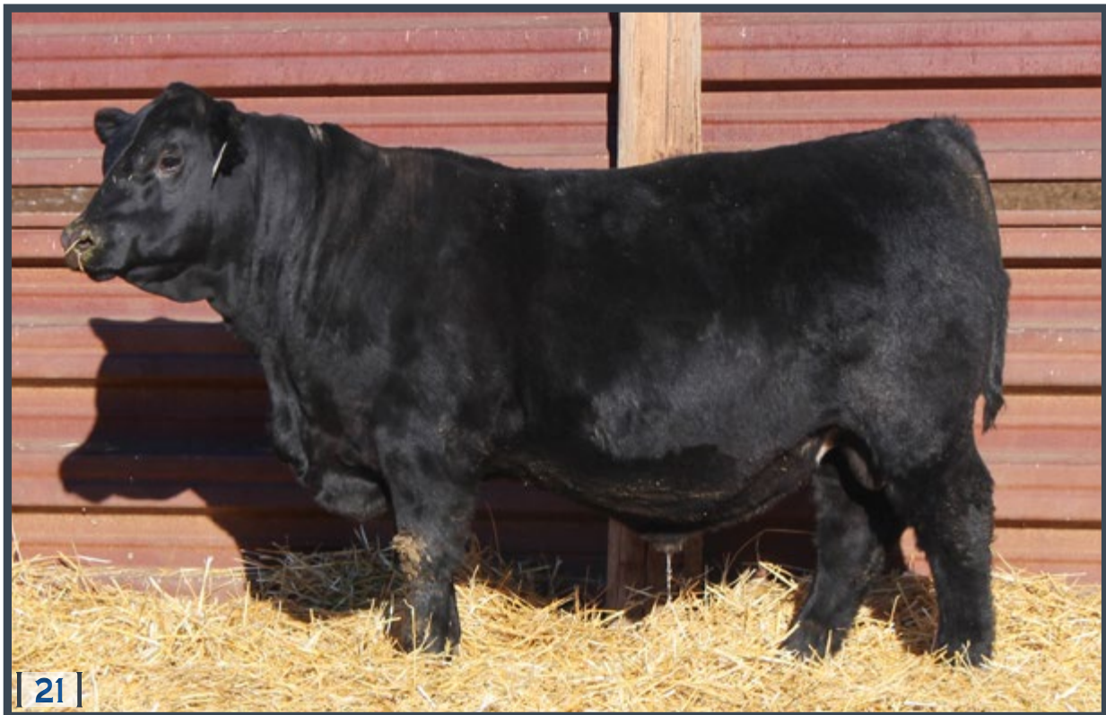
[ 21 ]